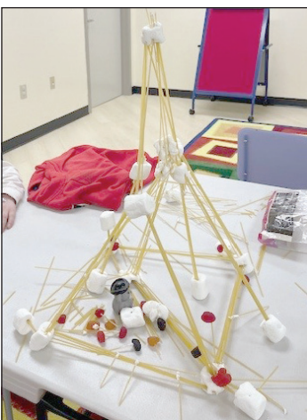
Children and their families got to experiment with different spaghetti tower structures at the public library’s spaghetti tower building event.