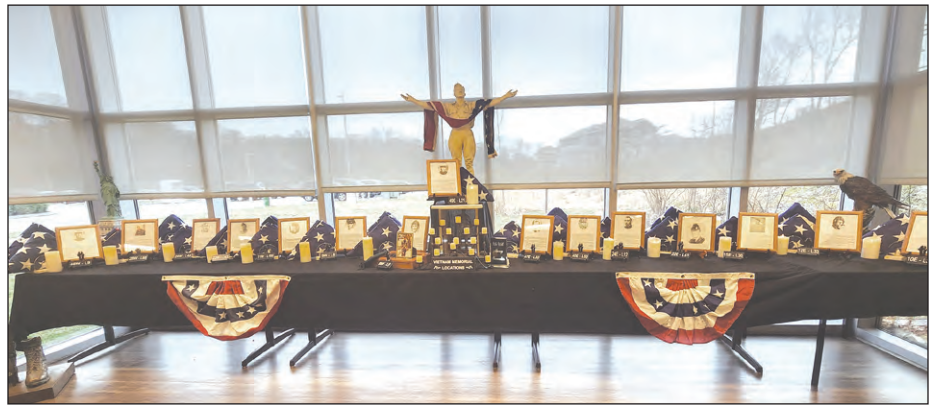
A wide shot of the memorial space honoring the 15 Vietnam Veterans of Chicopee who never made it home post-candlelight ceremony during the Vietnam Veterans Appreciation Day event at the RiverMills Senior Center.

Springfield begins a crucial six-game road trip on Friday night in Hartford against the Wolf Pack.