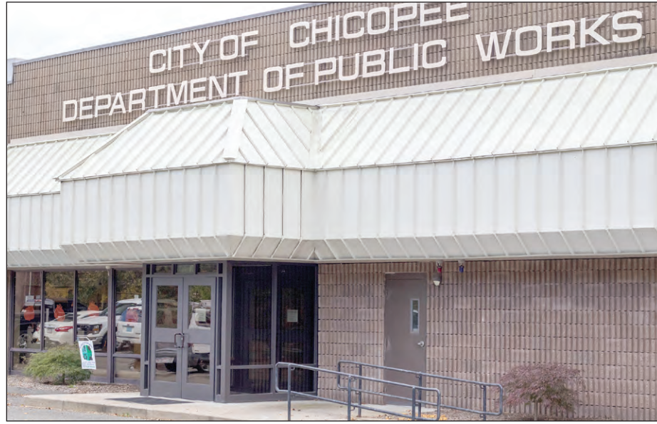
The Department of Public Works in Chicopee.