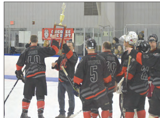
Members of the Chicopee Fire Department celebrate on the ice with their trophy after the game.

were able to hold on for a hard-fought 6-4 win.