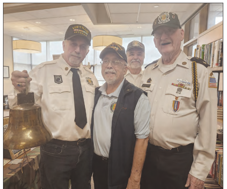
TURLEY