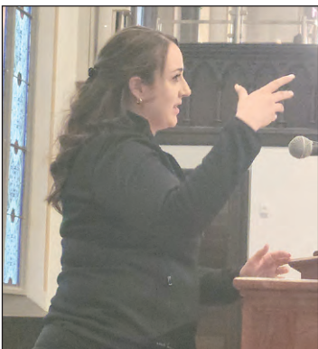
Amy Santiago offers her thoughts during the public hearing for reducing the speed limit to 25 mph.

The speed reduction would begin at the intersection of Memorial Drive and New Ludlow Road, traveling east to the South Hadley town line.