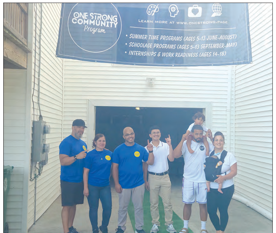
Staff, interns and volunteers at One Strong Community Program LLC take a group photo under their banner in celebration of their Sept. 1 grand opening on View Street in Chicopee.

"There's plenty of great choices in the City of Chicopee. There's not a bad program in the area, and you know, if we're what they're ultimately going for I hope they made the right decision, and if not, I'm always willing to rec-