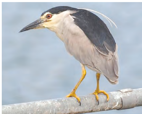
Black-crowned night heron

The Massachusetts Audubon Society reported the sighting of a black-crowned night heron in Pittsfield.