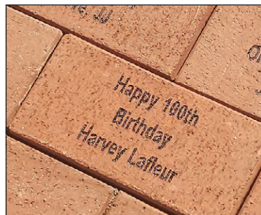
A close-up of the brick reading "Happy 100th Birthday Harvey Lafleur" in the entryway patio outside Lorraine's Soup Kitchen & Pantry.

Lafleur encouraged residents to continue donating to Lorraine's "as much as you can" and to stop by if