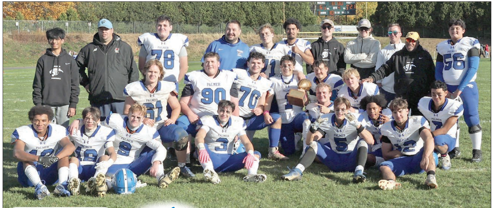
The Palmer High School football program is coming off its first victory in more than a decade over Ware.