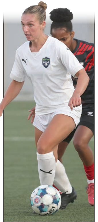
Turley