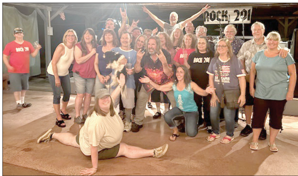
Fans of Rock 201 joined the band on the stage after the performance.