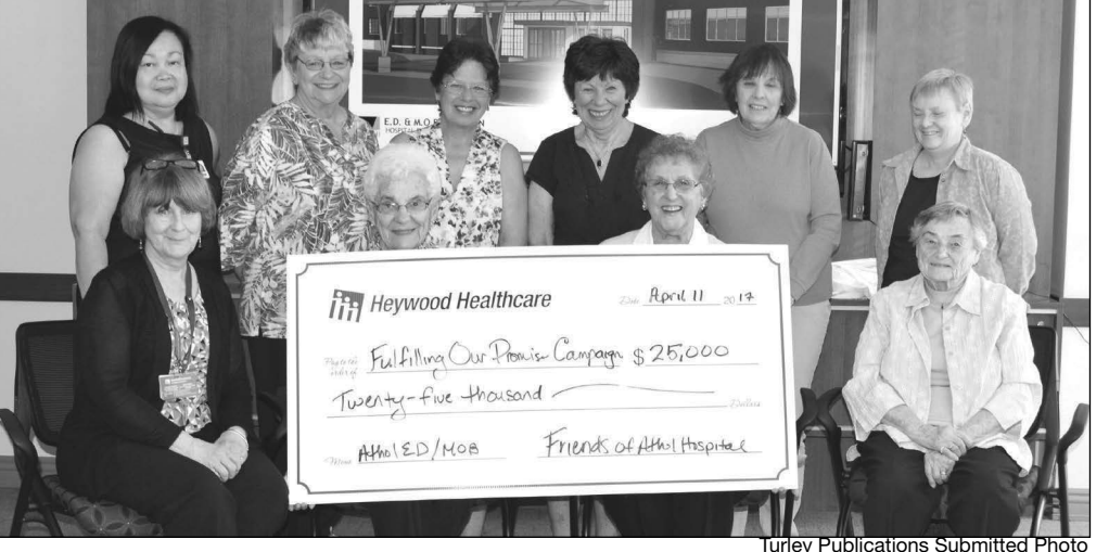
Members of the Friends of Athol Hospital have pledged $25,000 to Athol Hospital Emergency Department and Medical Office Building Project.