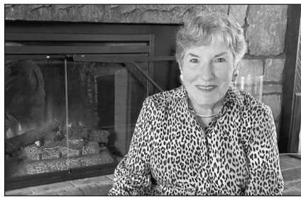
Page One Productions will bring a new Dinner Show to the Brass Rail in Southwick next month. SUBMITTED PHOTO

For more information, contact PageOneProductions@att.net or call/text 413-530-8000, or send check or money order payable to Page One Productions, P.O. Box 423 West Springfield, MA 01090. Deadline is Tuesday, Sept. 19 with no refunds.