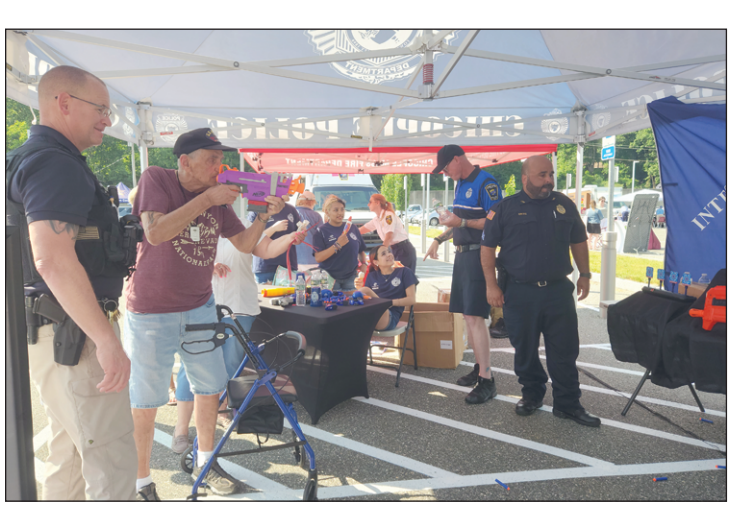
A senior prepares to fire a Nerf Gun for a target game at the police department's tent during the Summer Carnival at RiverMills Senior Center.