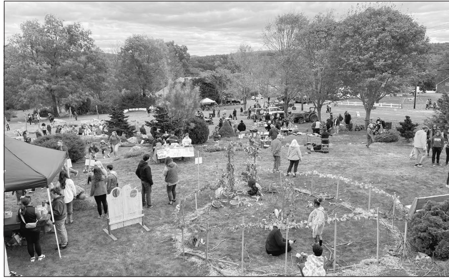
Visitors to the Fall Festival fill the Westhampton Public Library field.

After School Fun includes Thursdays at 3:30 p.m.; LEGO Club first Thursday; Craft Club second Thursday; Nintendo Switch Happy