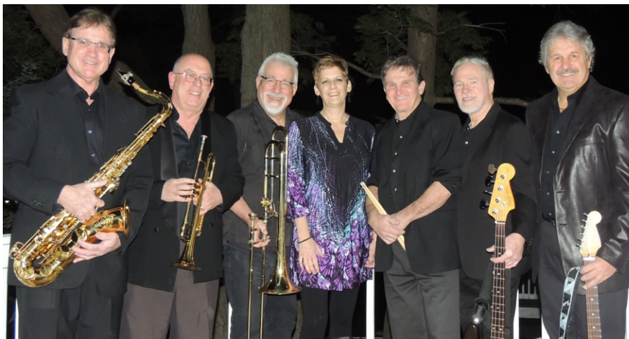
The Deloreans will perform on Sunday, July 9 from 2-5 p.m. at Powder Mill Park, corner Smithville and Meadow Roads.

Please do not donate alcohol or mixers intended to be used with alcohol, over the counter oral medications, flammable products (such as lighter, matches or charcoal), products in glass containers, perishable products, opened products or expired products.