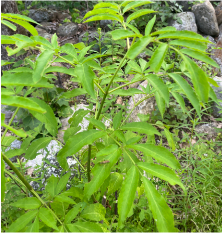
Close-up of the elderberry leaves – compound, opposite leaves with lance-shaped leaflets.

The deer's olfactory sense is very acute, having evolved to help them find food at great distances, and also to detect predators. But because of their heavy reliance on this one sense, they