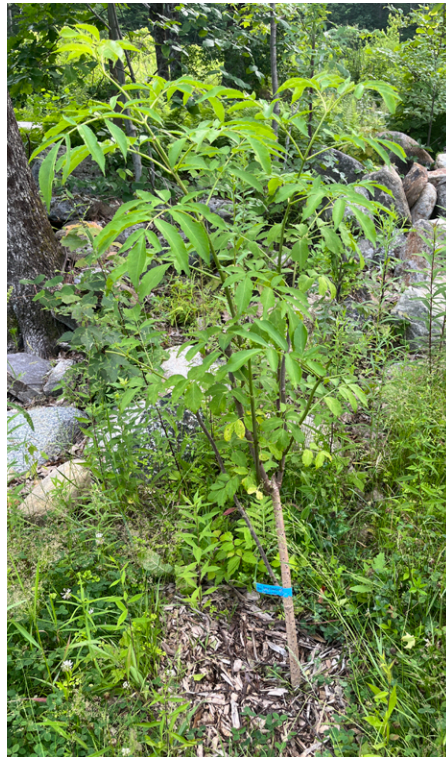
Samyl Elderberry (Sambucus nigra cultivar), prized for its sweet berries, showing the ramial mulch at the base.

avoid strong odors that might easily overwhelm their normal sense of smell and interfere with their detection of a nearby predator.