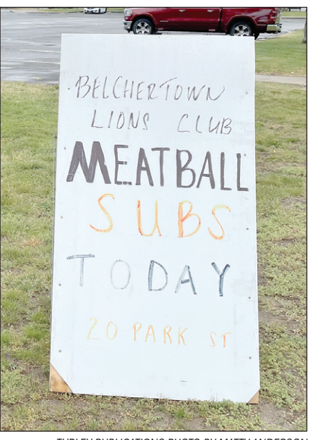
A sign Promoting the fundraising meatball subs.