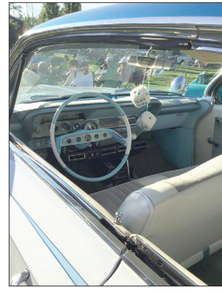
A regional music and car show is scheduled on