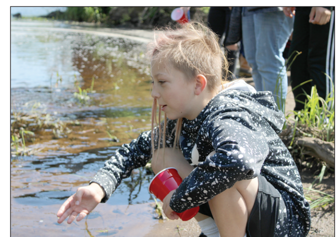
ABOVE: Students said goodbye to the fish they raised in their school.