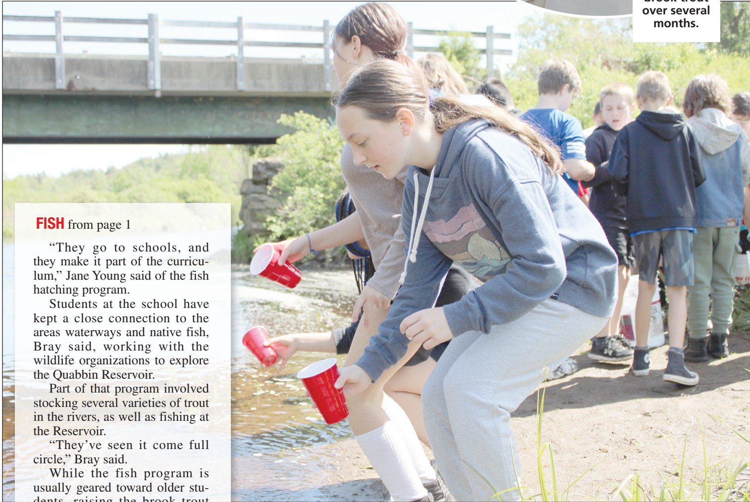
Students used cups to move the fish from buckets to the river.