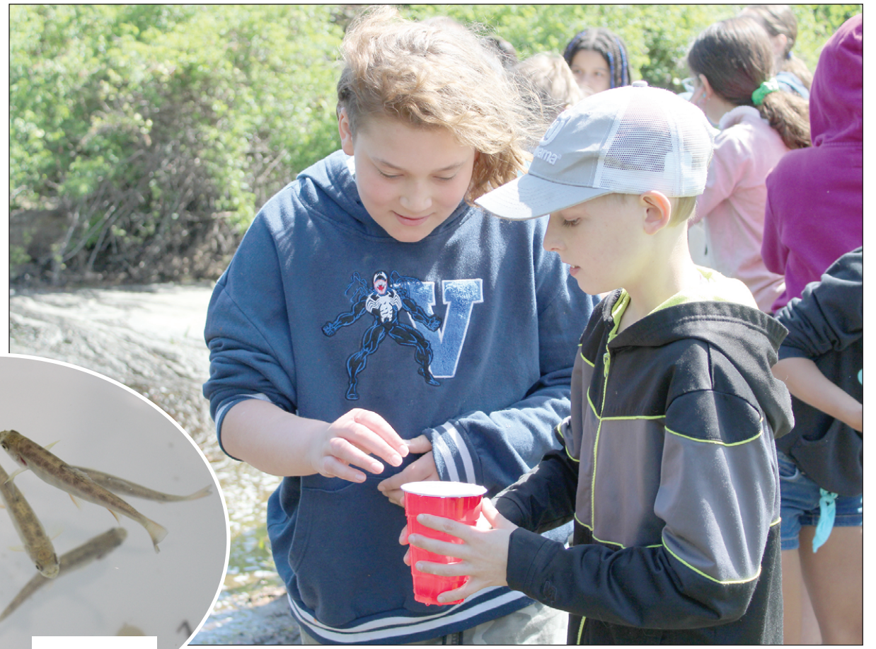
Hardwick Elementary School students get ready to release brook trout fry into the Ware River.