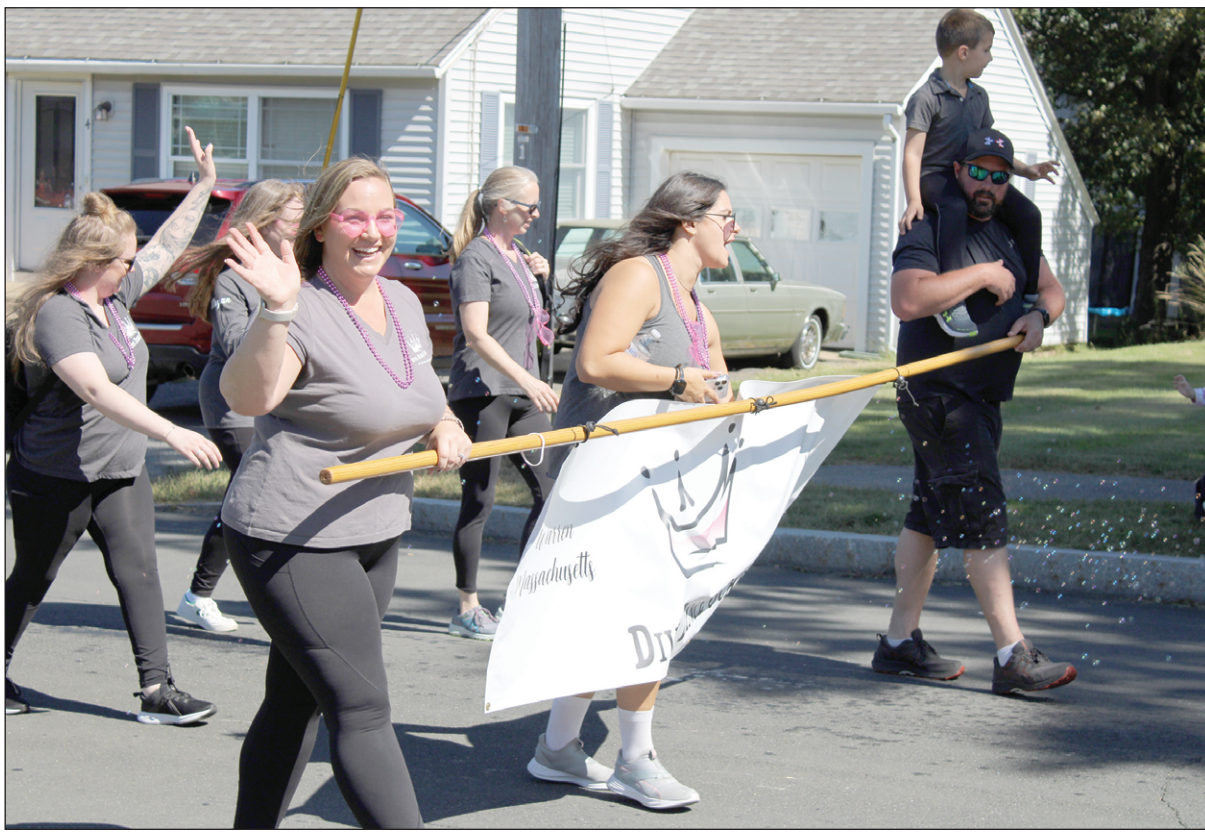
Diva Dance School in Warren participated in Brookfield's 350th birthday celebration parade this past Sunday.