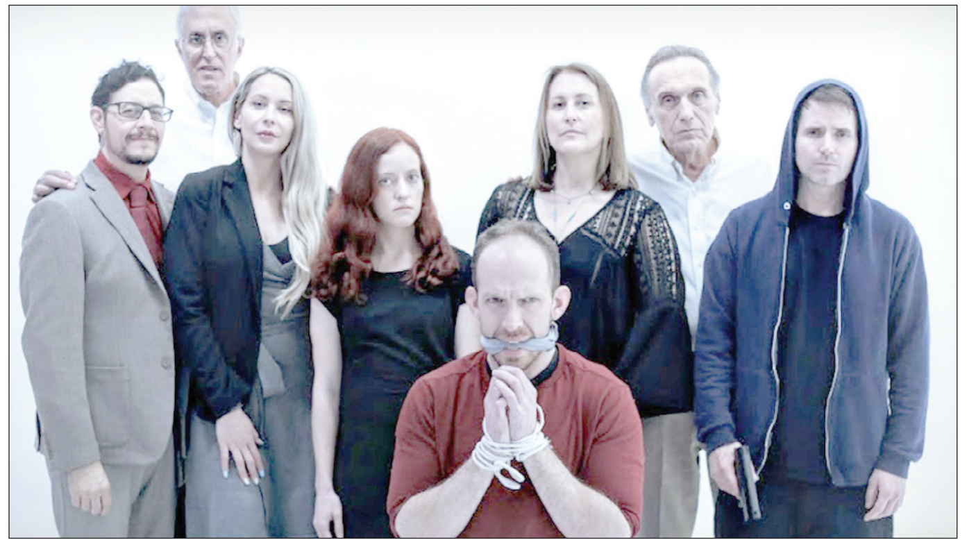
The cast of "Fatal Justice".