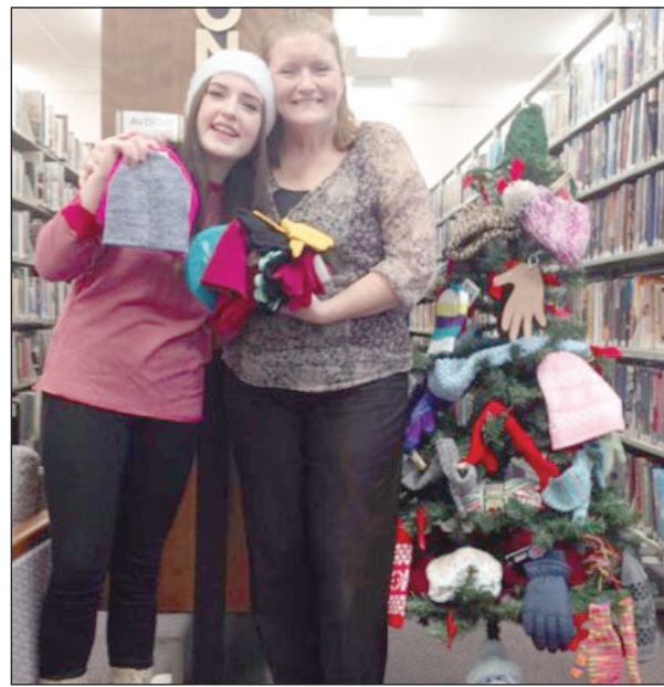
Submitted photo Ellen Moriarty