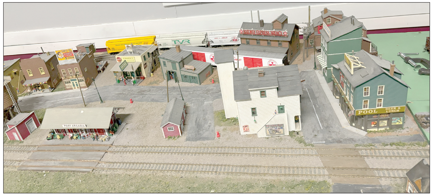
Model Train Village at the Amherst Railway Society Clubhouse

Your correspondent admits to being a bit surprised by the date of 1934.