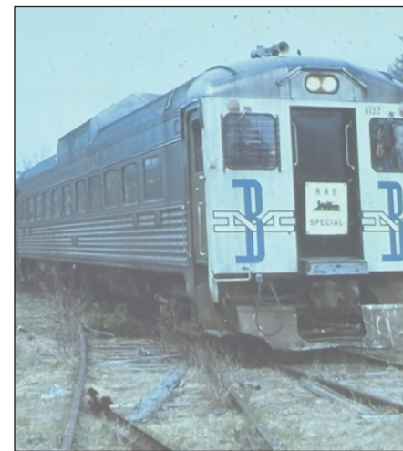
This photo shows a Boston & Maine Budd Liner RDC

There was a train known as the Budd Liner or Budd Rail Diesel Car remembered from the 1950s. They were silver,