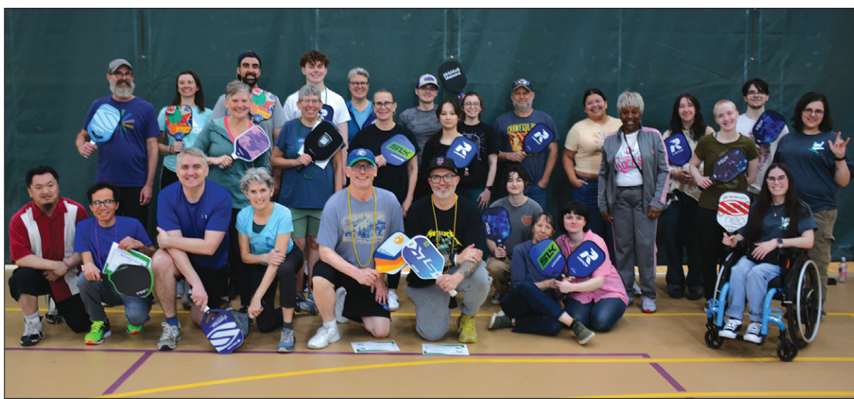
A look at last year's tournament