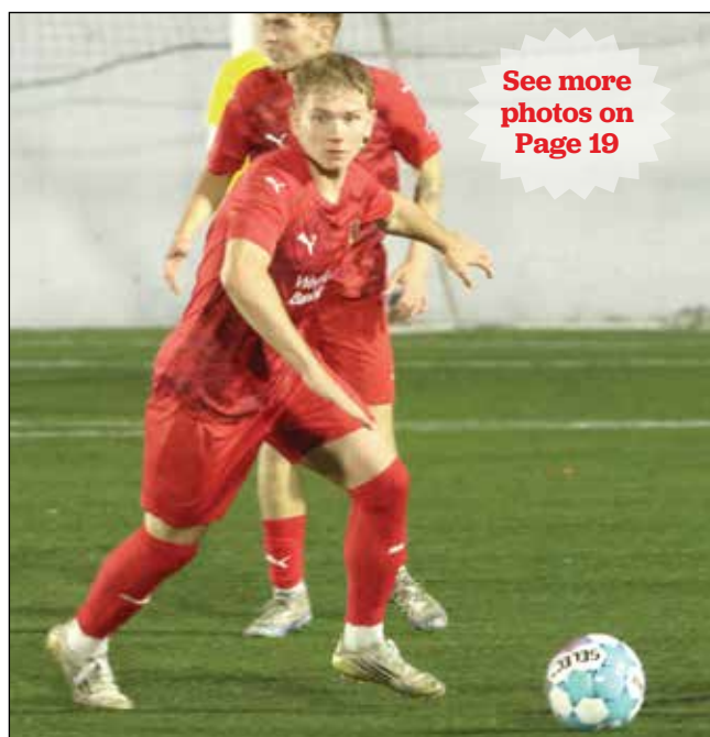
See more photos on Page 19

Ware was scheduled to face Bristol County Agricultural High School in the Round of 32.