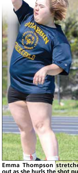
Emma Thompson stretches out as she hurls the shot put.